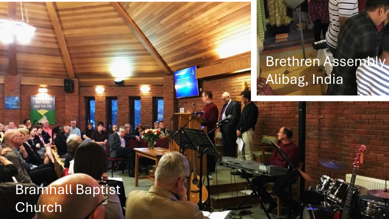
Bramhall Baptist Church