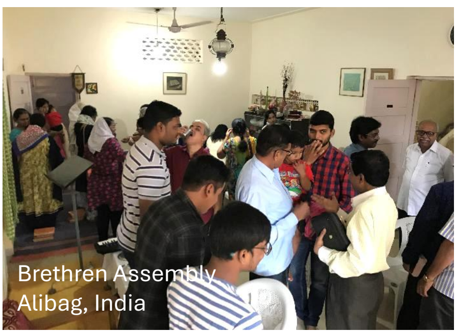
Brethren Assembly Alibag, India