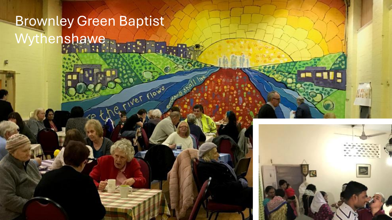
Brownley Green Baptist Wythenshawe