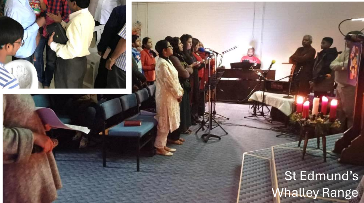
St Edmund's Whalley Range