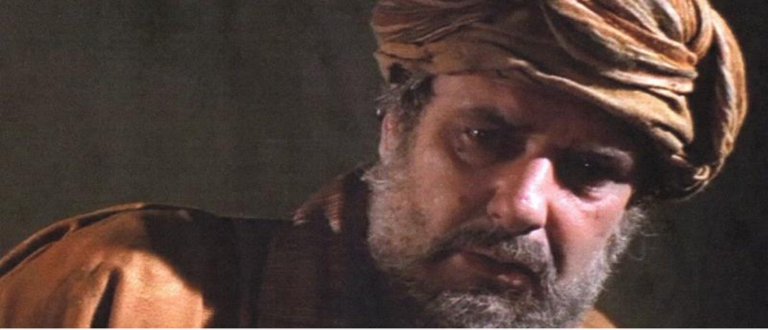
Simon the Pharisee