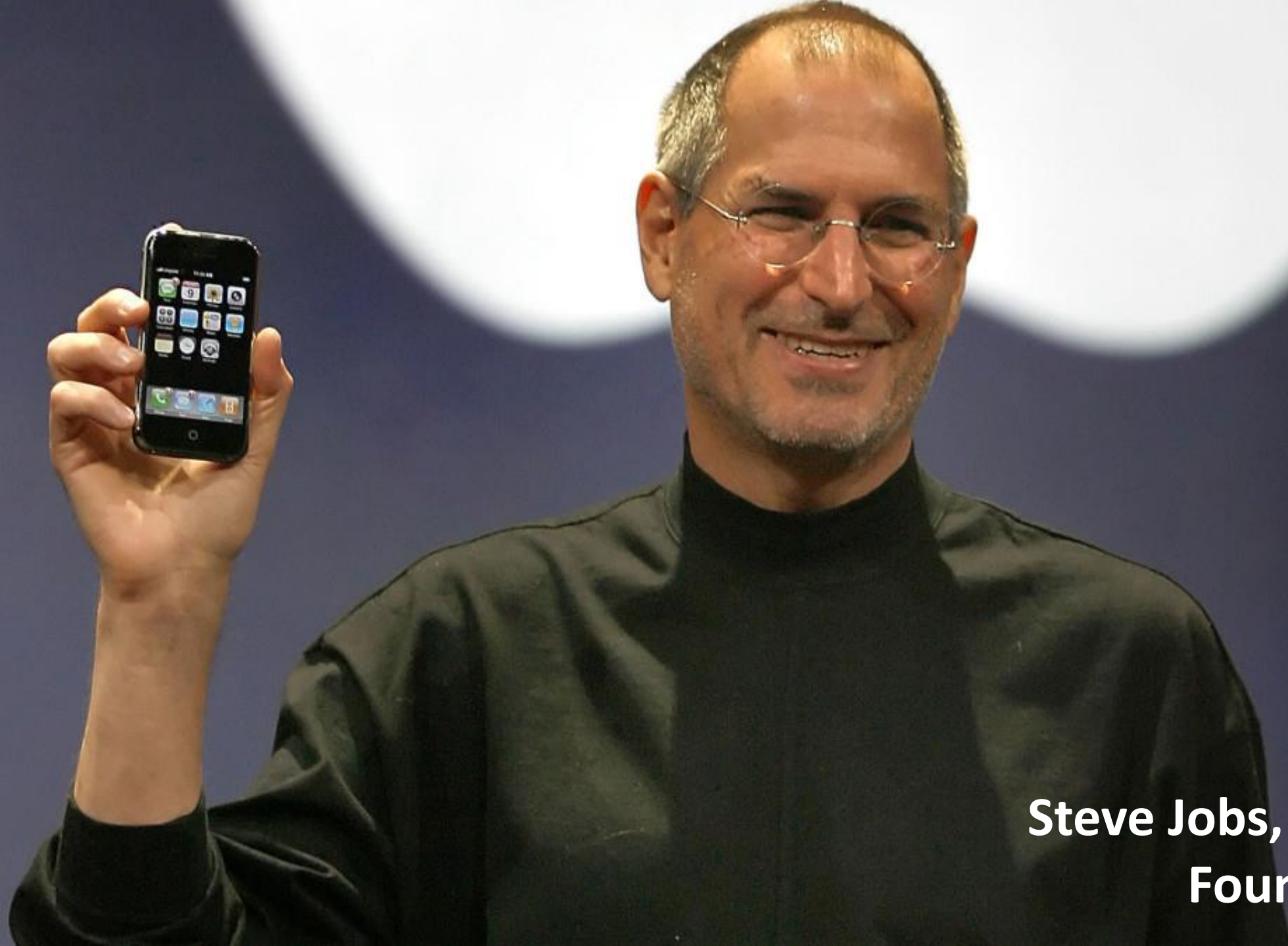
Steve Jobs, 1955-2011 Founder, Apple