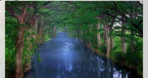
Ezekiel 47, 1-12