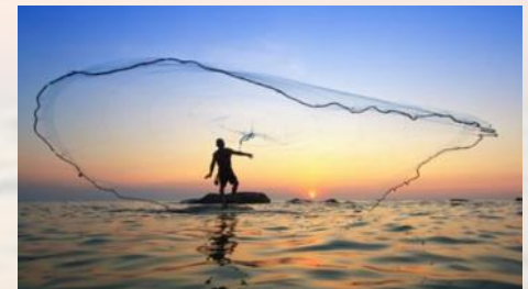
Luke 5, 4-6